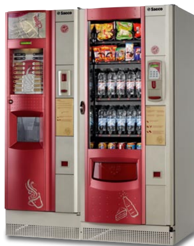
Quarzo 500 + Smeraldo 36