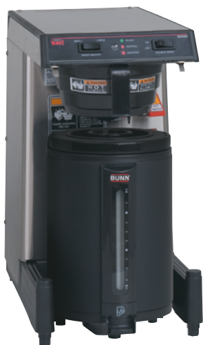
Model WAVE-S-BF-APS with 2.5 litre Thermal Server (thermal server sold separately)

Dimensions: 16.94-18.69" H x 9.71 W x 17.24"D (43cm H x 22.2cm W x 43.8cm D)