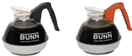
Easy Pour ® Decanters