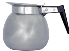
Stainless Steel Decanters

For current specification sheets and other information, go to www.bunn.com .